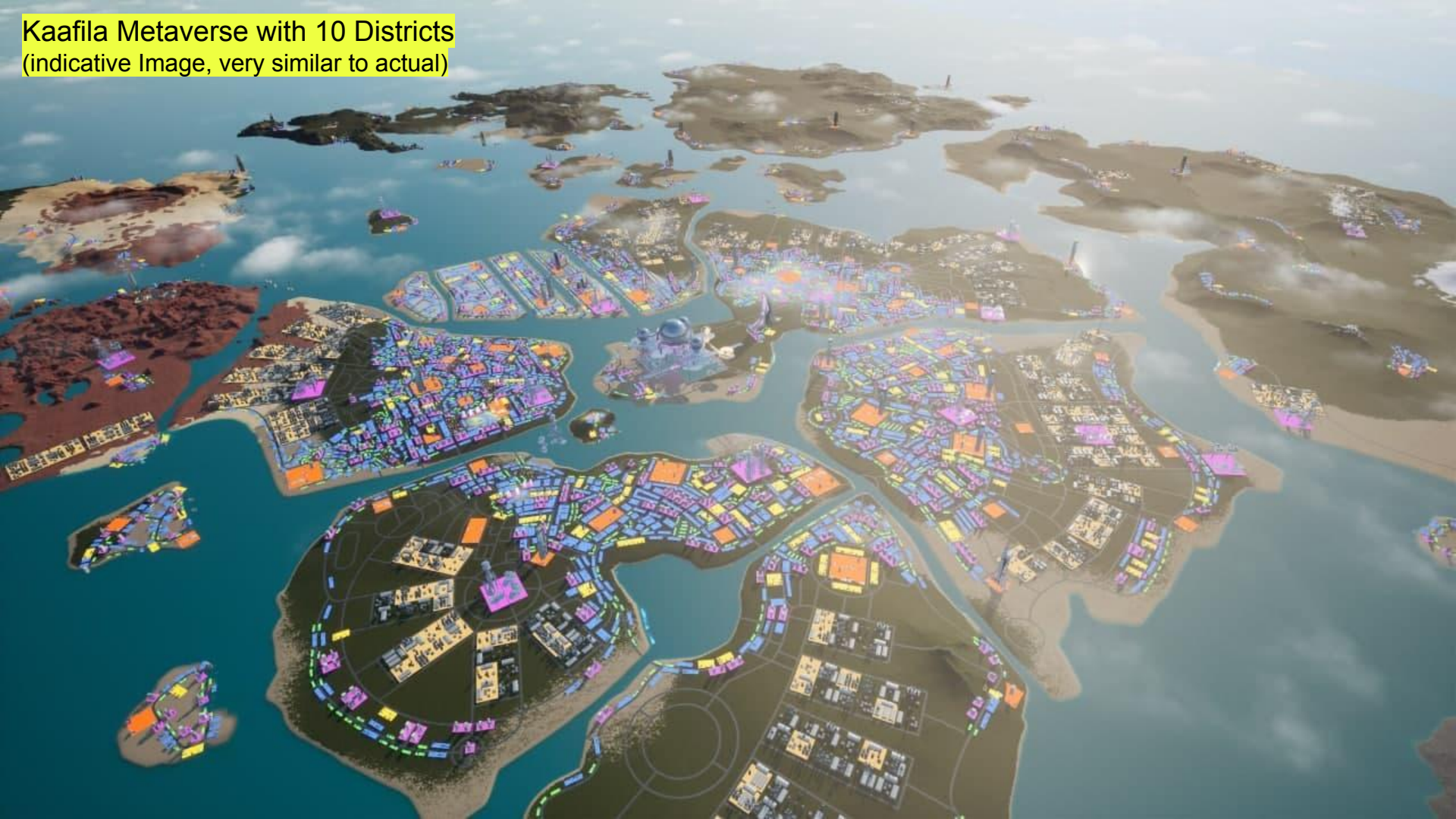
Kaafila Metaverse with 10 Districts (indicative Image, very similar to actual)