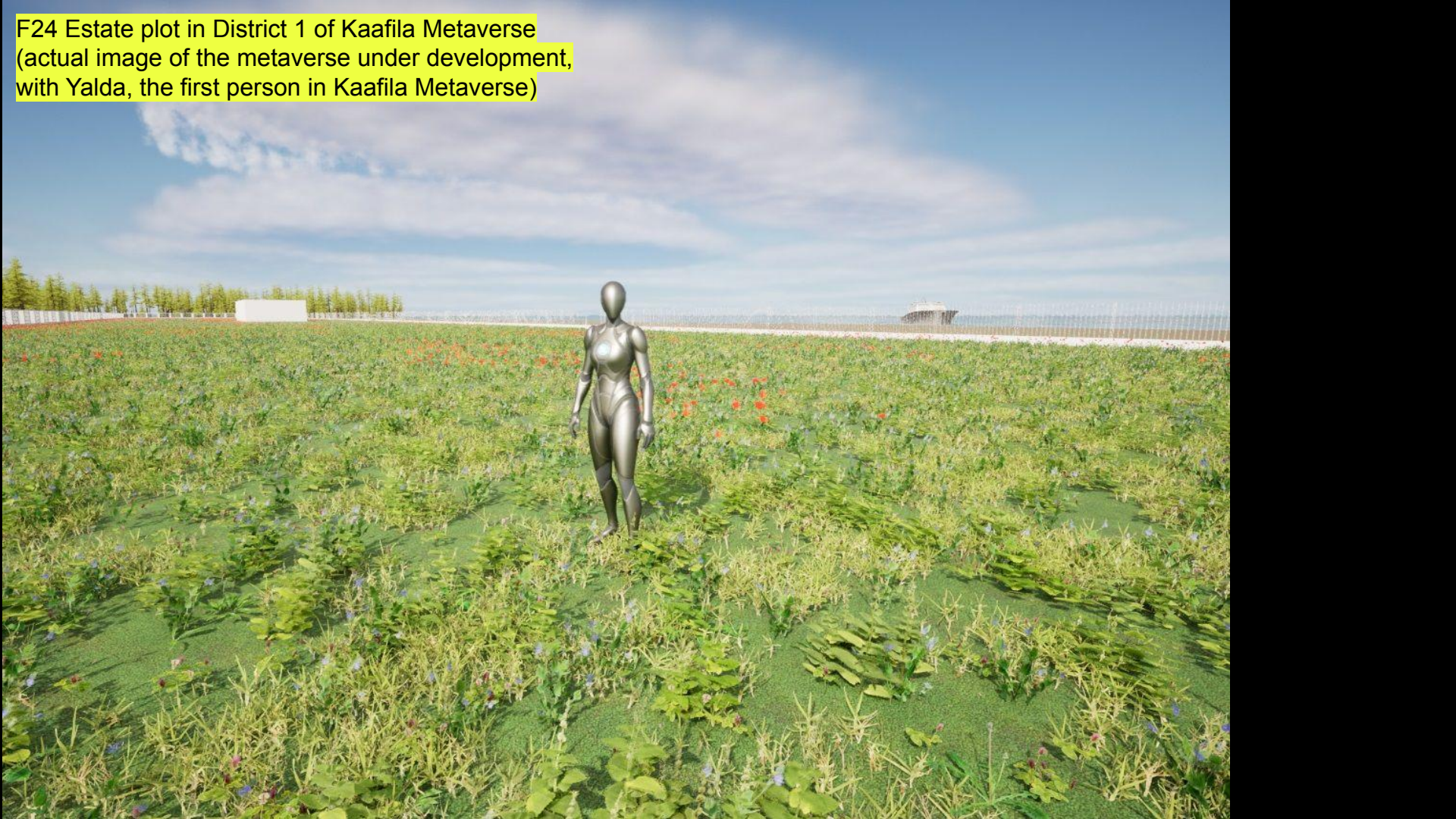
F24 Estate plot in District 1 of Kaafila Metaverse (actual image of the metaverse under development, with Yalda, the first person in Kaafila Metaverse)